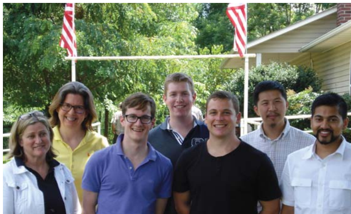
our visitors from Australia

As we celebrate the Fourth of July we recall the words from Galatians 5:31: “So then, brethren, we are not the children of the bondwoman but of the free: by the freedom wherewith Christ has made us free.” We need to ask ourselves are we truly “free?” With the latest Supreme Court decisions, have we been made “children of the bondwoman?” But we know that Christ has redeemed us with His Precious Blood, which flowed out of His side on Calvary. As citizens of the United States of America we have Constitutional rights that are supposed to guarantee our freedom of religion, of speech, etc. As citizens we need to pray fervently that our God-given freedom is preserved in our country.