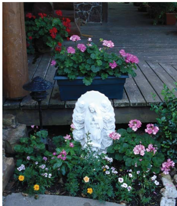
our little Mary's Garden

As we Benedictine Sisters of Clear Creek go about our day of ora et labora , we carry each of you and your intentions in our hearts. We pray in thanksgiving each day for your generosity to us. May God reward you, and may Our Lady keep you close to Her Immaculate Heart and the Sacred Heart of Her Son.